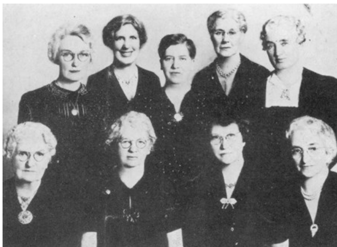
Charter members of the first Soroptimist Club, 1921

The name Soroptimist was coined from the Latin soror meaning sister, and optima meaning best. And so Soroptimist is perhaps best interpreted as 'the best for women'.