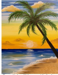
Zoom link will be provided after purchase of virtual ticket.