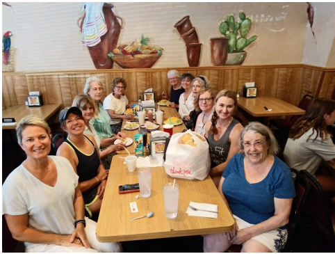
La Comida July 7th