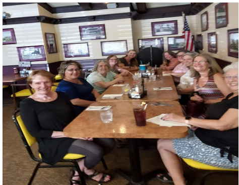
Kalico Kitchen August 4th