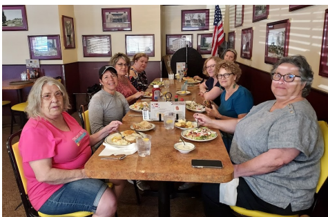
Kalico Kitchen August 18th