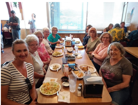
La Comida July 21st