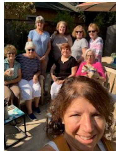
Morning Coffee at Kimm's Aug. 25th