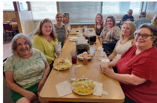
La Comida August 11th