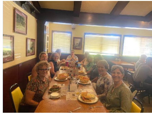
Kalico Kitchen July 14th