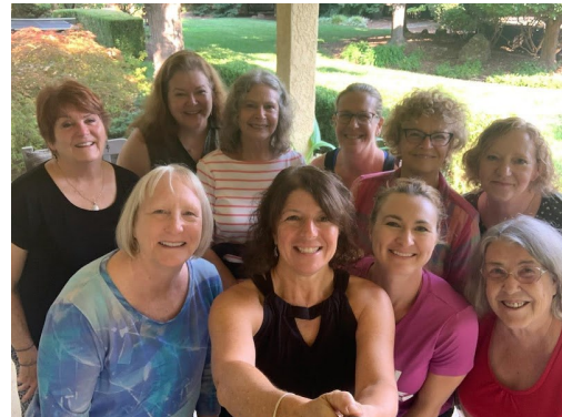
Morning Coffee at Bonnie's July 28th